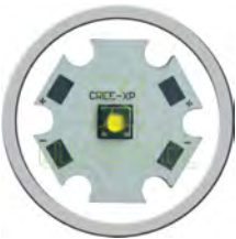
LED light source(CREE)