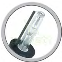
HID light source