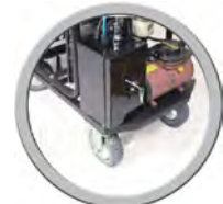
Controlling box (optional)