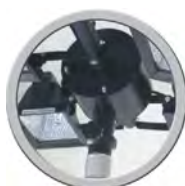
Adjust the angle automatically